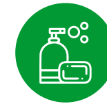
Clothes and Resources