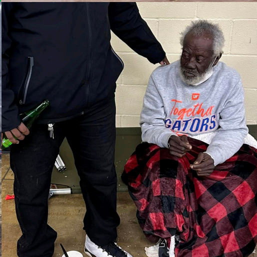
A program of OurCalling