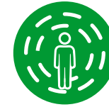
Life Skills Class