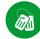
Veterans Affairs Support