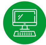
Access to Technology