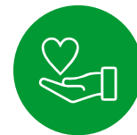
Specialized Partner Services