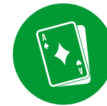
Planned Community Activities