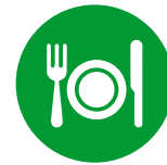
Daily Meal Service