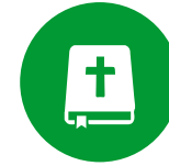
Weekly Bible Studies/Church Service