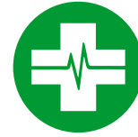
Medical/Mental Health Services